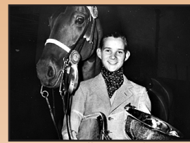
1941 - William Steinkraus